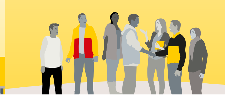
Helping refugees become integrated in Germany.