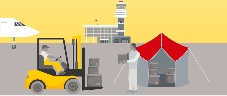
Improving disaster management at airports.